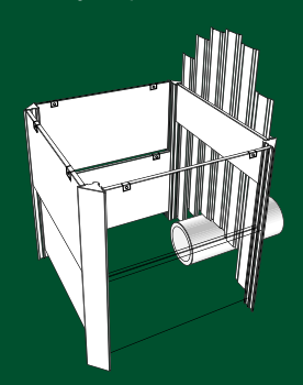
Small rectangular pit with sheeting on one (or both) ends

Small rectangular pit closed all four sides