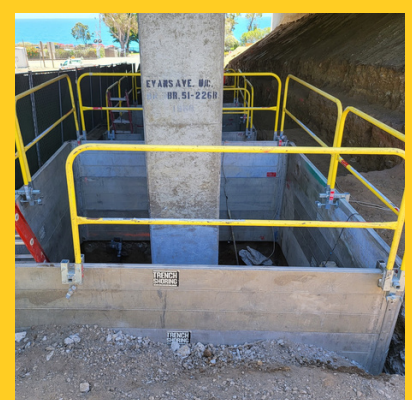
Railguard 200 Safety Rail

Once an excavation is opened, a potential fall hazard may have been created at the top of the trench. That's why we provide an extensive line of fall protection gear to keep you and your employees safe, in and around an excavation. Ask your Shoring Consultant for a copy of our Fall Protection brochure.