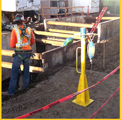
Fall Protection Achor Post