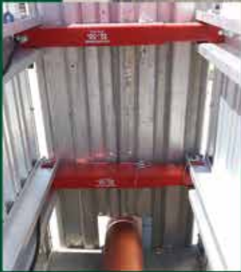
End Shore with Panel